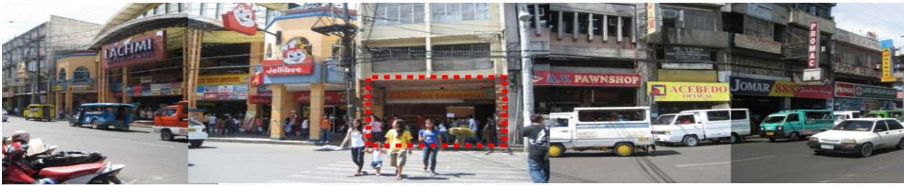
PANORAMIC VIEW ACROSS THE SITE